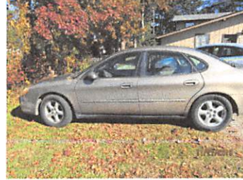
618-A 35 th Ave N