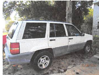
413 18 th Ave N (R.O.W)