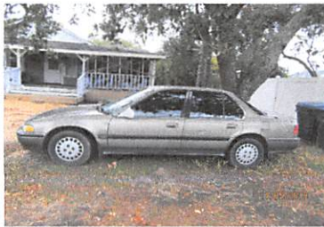
407 Chester St.