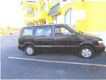
502 S Kings Hwy