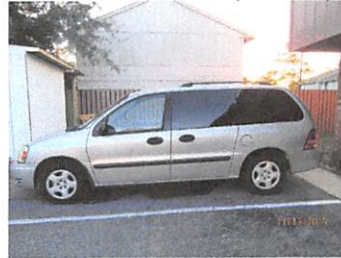
801 66 th Ave N (Unit#12)