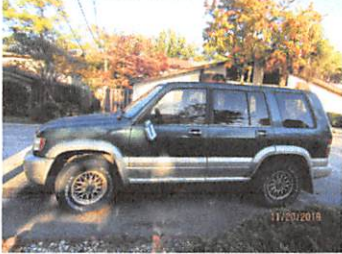
608-A 35 th Ave N