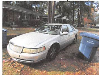
915 4 th Ave N (R.O.W)