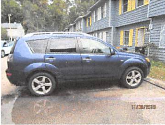
306 Ceder St. (Unit #1)