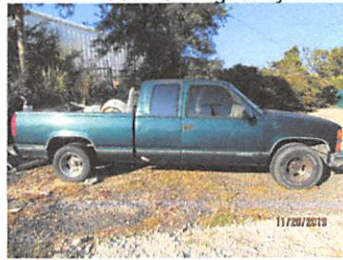
1108 S Kings Hwy