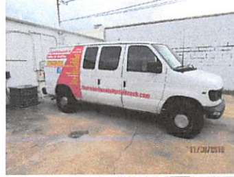
303 Broadway (Alley Way)