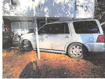
730 Columbia Dr.