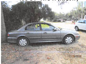
408 31 st Ave N (R.O.W)