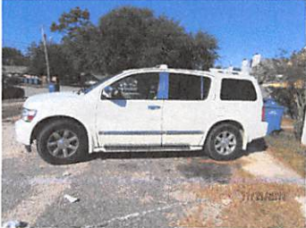
606-C 35 th Ave N