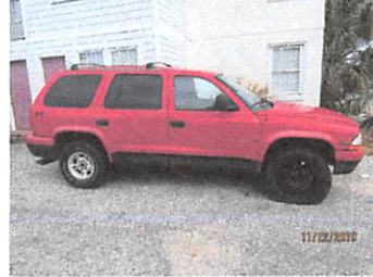
36 th Ave N / Oak St (Vacant Lot)