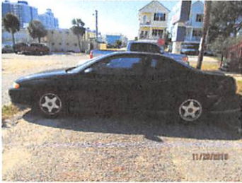
204 26 th Ave S