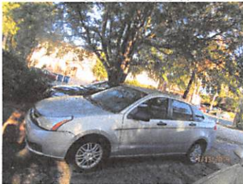
615 37 th Ave N