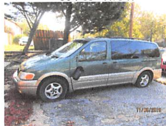
604 65 th Ave N