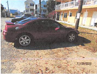
204 26 th Ave S