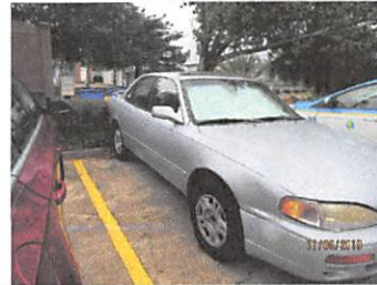
414 28 th Ave N

THE CONSTRUCTION SERVICES DEPARTMENT, CODE ENFORCEMENT DIVISION HAS TAGGED THE FOLLOWING VEHICLES IN ACCORDANCE WITH ARTICLE 41, CHAPTER 5 TITLE 56 OF THE S.C. CODE OF LAWS. SEVEN DAYS HAVE ELAPSED SINCE TAGGING AND THE VEHICLES HAVE NOT BEEN REMOVED. THIS FORM IS FORWARDED TO THE POLICE DEPARTMENT FOR FURTHER ENFORCEMENT ACTION AND DISPOSITION.