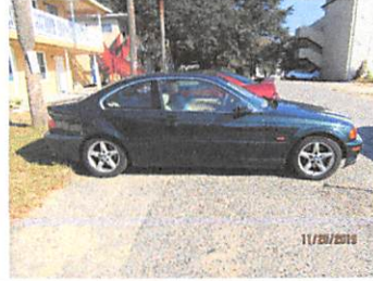
204 26 th Ave S